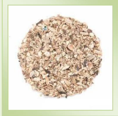
Burdock Root Herbal Tea