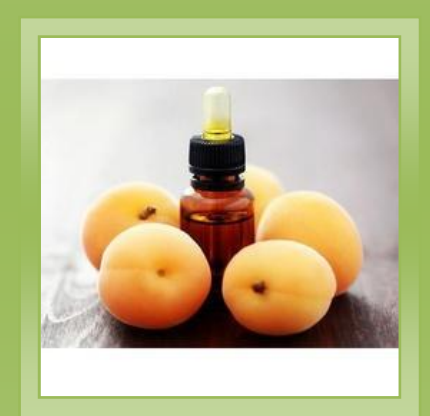
Apricot Kernel Oil