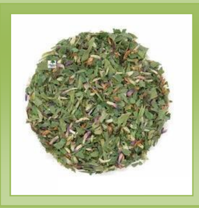
Red Clover Tea