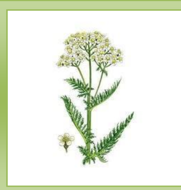
Yarrow Flowers - Cut And Amp