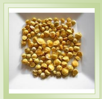
Himalyan/Kashmir Mountain Garlic