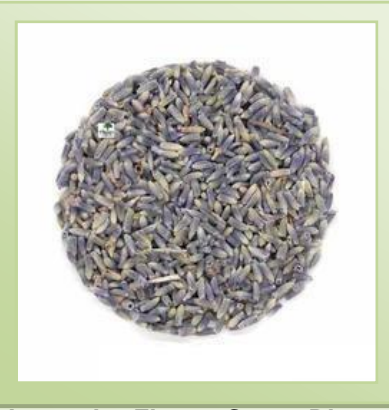
Lavender Flower Super Blue Tea