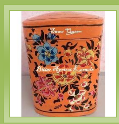
Bitter Apricot Kernels