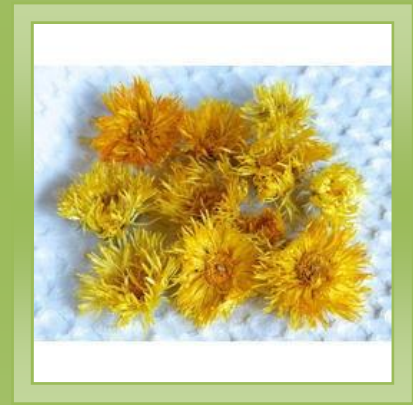
Whole Calendula Flower