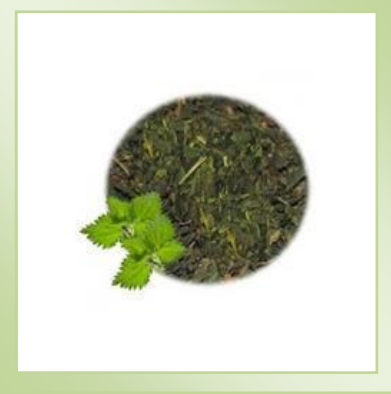
Nettle Leaf Tea