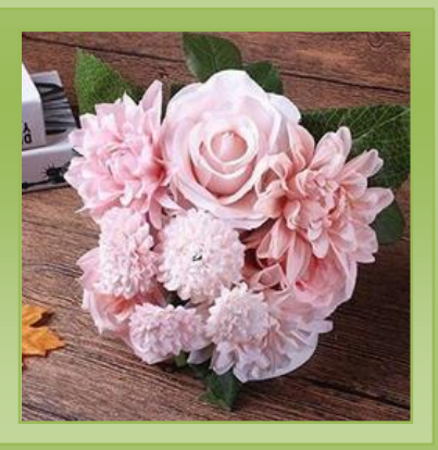
Chrysanthemum Flower Whole