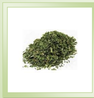
Dandelion Leaves Herbal Tea