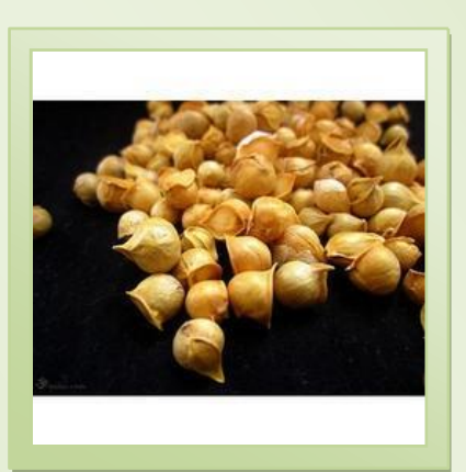
Snow Mountain Kashmiri Garlic